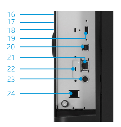
Side I/O panel close-up